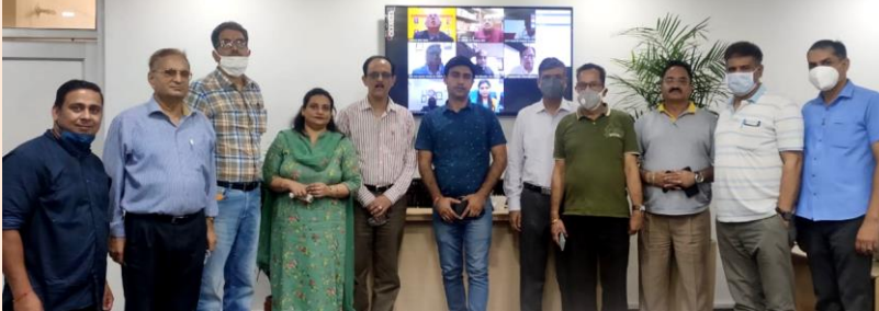
Engineers attending Royal Charters' Day 2020